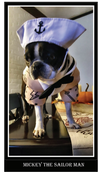
Office Mascot Mickey dresses for Halloween!