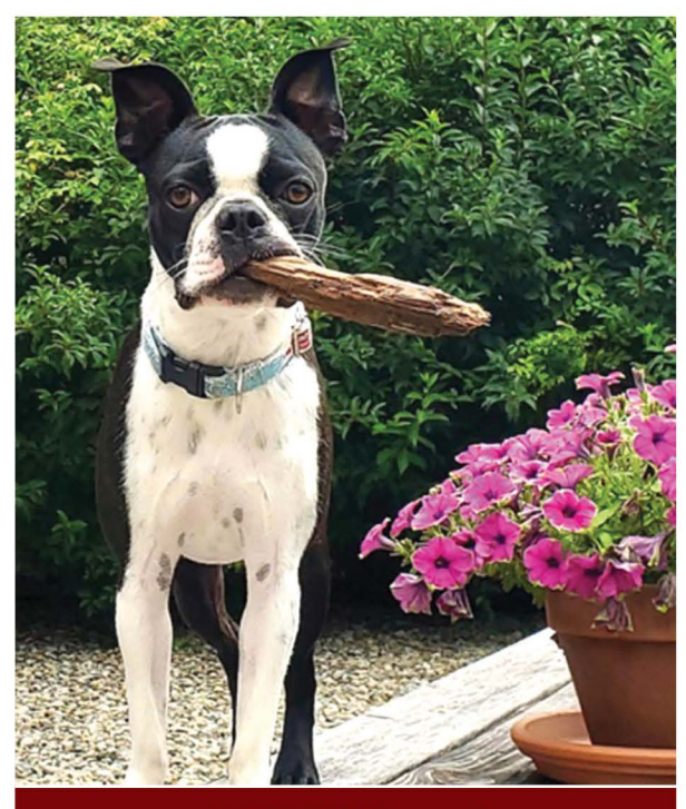
NJSOCF Mascot Sunny enjoys a piece of driftwood from the beach.

137 Union Boulevard Totowa, NJ 07512 P.O. Box 3648 Wayne, NJ 07474-3648 (973) 595-1232 (973) 595-1718 FAX njsocf.org