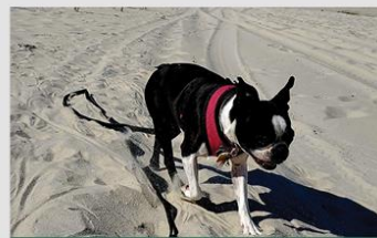
Office Mascot Sunny enjoys running and digging on Island Beach State Park whenever she gets the chance.